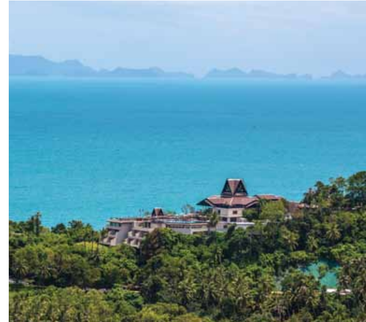
Koh Samui's first luxury resort