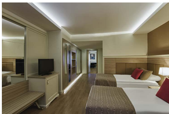
Family Room (Children)

Family Room: 43 m 2 . There are 1 parents room (1 french bed + 1 sofa), 1 children room (2 Single bed), LCD-TV, shower / WC, minibar, telephone, laminate flooring, balcony, safe, hair dryer Everyday: room cleaning, change of towels. Every 2 days: change of bed linen (Accommodation maximum: 3+2 oder 4+1)