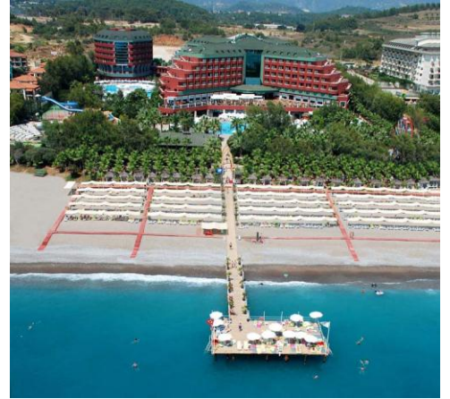
Main Building and Annex Building

Our hotel that offers you an excellent holiday option consists of a six-storey building (416 standard rooms) and a seven-storey annex building (79 family rooms and 3 standard rooms). In the main building there are 4 panoramic elevators and in the annex building are 3 elevators. In the lobby floor you find the reception, piano bar with live music, Delphin Cafe & Bar and stores for shopping.