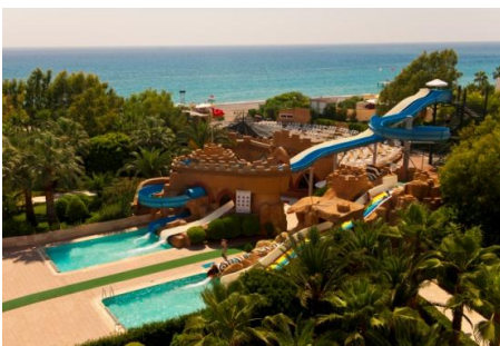
Pool with Water Slides 1 and 2