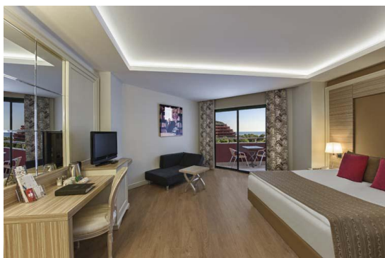
Family Room (Parents)

Technical Details Hotel for Disabled Guests: in total 5 rooms, have the same features as the standard rooms, an emergency button, shower / WC are available. The rooms have Land View. Technical details: door 80 cm, balcony door: 85 cm, elevator door: 80 cm, bathroom door: 80 cm. The reception, restaurants, swimming pools and the beach are accessible with a wheelchair.