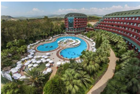
Pool 1 (Relax Pool)

The opening times of the pools are changeable in depending on the weather situation.