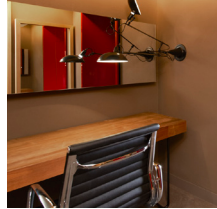
RECYCLE PEAK WOOD DESK A modern and juxtaposition shape