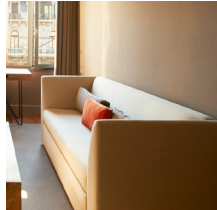
SOFA BED Comfortable Sofa Bed Perfect for families