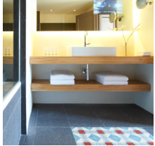
MOSAICO HIDRAULICO A heritage detail material

Discover the comfort of a great suite with spectacular views over Barcelona. In the bedroom, find a unique rest experience with Le Méridien bed, a fresh & dynamic working space, large walking Discover the comfort of a great suite with spectacular views over Barcelona. In the bedroom, find a unique rest experience with Le Méridien bed, closet, 42" flat screen TV, Ipad & Iphone docking station, bathroom tv/mirror, floor heating, tea & coffee facilities, connecting rooms, turndown services, cinq mondes amenities, selected magazines, maxi-refreshment center, rain shower, 24hr room service. All features consistent with the brand spirit, the cities style and respectful with the environment.