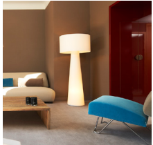
CADAQUES SOFA & IBIZA ARMCHAIR Historical pieces of the local design panorama