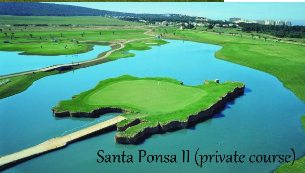
Santa Ponsa II (private course)

Santa Ponsa II is a private golf course where our Golf Tournament take place.