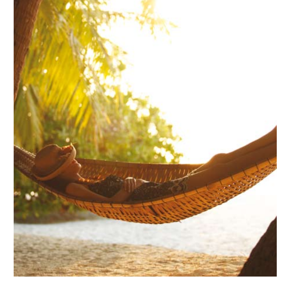
"Forget not that the earth delights to feel your bare feet and the winds long to play with your hair."